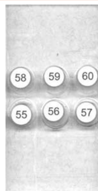
Figure 1: Device with 6 TLDs dosimeters

The TLDs readings of the doses were highly dispersed, complicated the accomplishment of the calibration tests and the dose mapping of the irradiator for this kind of dosimeter.