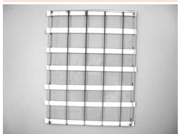
Figure 4: Assembly for Gafchromic Dosimeter

45°). For the 0° position, the dose uniformity factor value ratio between greater and lesser value is 1.79. For the 90° position, the dose uniformity factor value was 1.88. And for the 45° position, the dose uniformity factor value was 1.69.