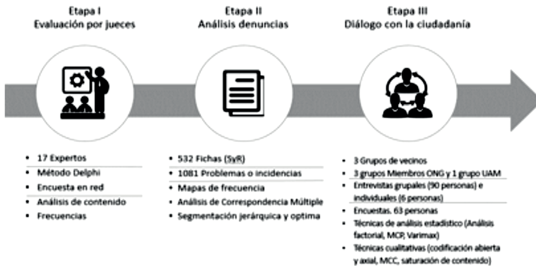
Figure 3. Types of data and analysis according to stages of the research.

Stage III. Dialog with citizens. Objective: To propose a theorization in order to understand complaint behavior in environmental issues.