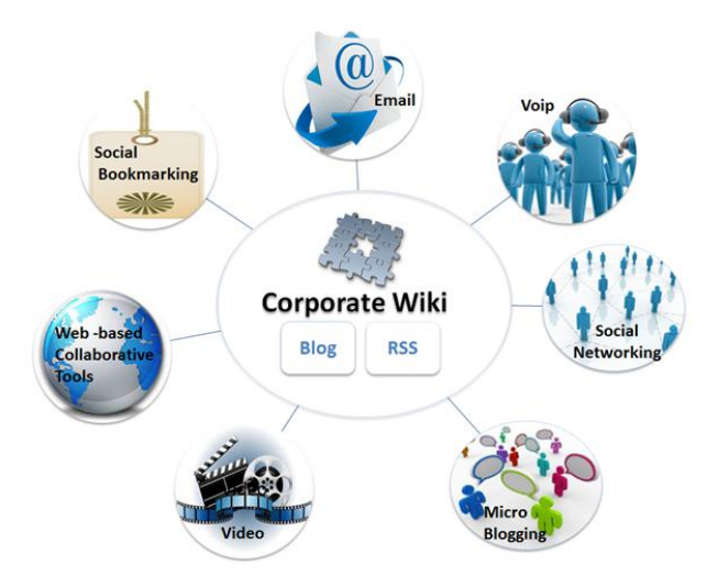
Figure 1: Using web 2.0 technologies in Project Management.

Videos recorded in meetings or in the execution of technical procedures, relevant conversations carried out through VoIP and URLs of the documents in web-based collaborative tools should be also stored in the wiki. The flexibility provided by web 2.0 technologies allows integrating project information managed for different applications and media.