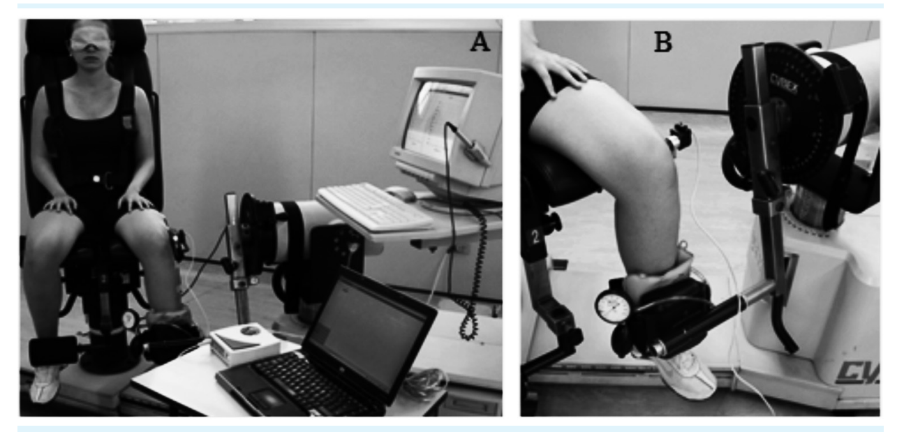
Figure 1: A – Open kinetic chain exercises position; B – Detailed position of the sphygmomanometer and electrogoniometer

instructed to perform squats in the typical fashion (Figure 2). After these repetitions, they were instructed to actively reproduce the angle three times, and the values were controlled and stored by the electrogoniometer. Figure 3 shows the evaluations of the participants in terms of eligibility criteria, their distribution among groups, and type of assessment.